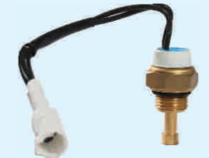
013-TSA-I - (RADIATOR FAN)

Application : INDCA, INDGO, CS, VSTA, XETA, MARINA MRP : INR 275.00