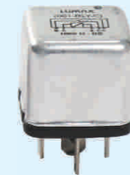
MINI / MICRO RELAY 001-RLY-C

Description : Mini Relay (DC) - 5 Pin Application : Universal Volt : 12V AMP/WATT : 20A MRP : INR 101.00