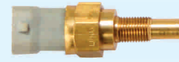
009-TSU-M (GREY COUPLER)

Application : TATA MAGIC/IRIS MRP : INR 198.00