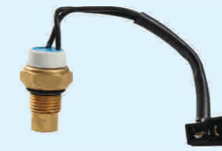
013-TSA-S - (SMALL THR)

Application : INDCA, INDGO, CS, VSTA, XETA, MARINA MRP : INR 256.00