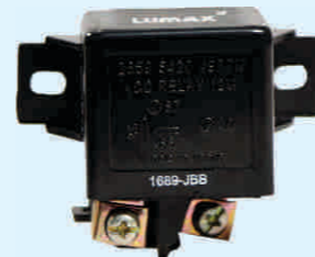
MULTIPURPOSE RELAY 011-ACR-

Description : Acc Relay - W/o Wire Application : TATA-SUMO, INDICA, 1210SE, 1312, 1612, 2515, HCV Volt : 12V AMP/WATT : 30A MRP : 198.00