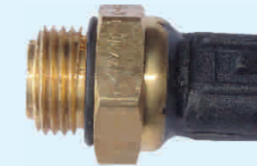
035-TSA-B - (BIG THR)

Application : 1000 CC, ESTM, ESTM N/M, SX4 MRP : INR 325.00